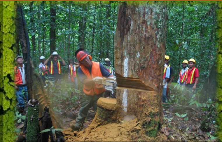
Guyana Forestry Training Centre (FTCI) conducting RIL training in the Iwokrama Forest.

Guyana has a strong foundation for the implementation of reduced-impact logging (RIL) practices as described in the national code of practice for timber harvesting. With continued support for RIL training for forestry personnel at the Forestry Training Centre (FTCI) along with strong enforcement and monitoring, Guyana's forest will continue to contribute to both national development and climate change mitigation.